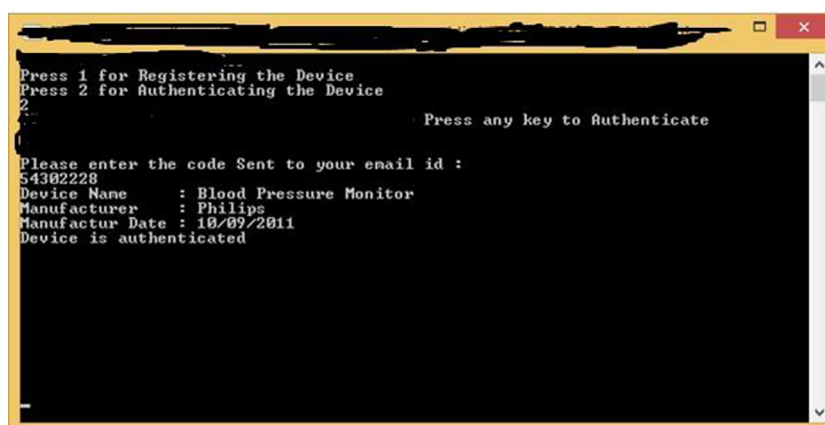
Figure 2 Device authentication.

Cost plays a vital role in implementation of any technology. NFC technology is affordable and secure; an NFC card costs <40 p and can be reused multiple times by different users, which makes it economically viable.