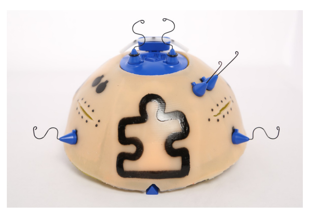
Figure 2 Fundamentals of Robotic Surgery dome device.

We believe that such a curriculum should encompass knowledge base (cognitive skill), tactile skill (psychomotor), and nontechnical skills (communication/team building). The basis for this curriculum should be surgical simulation, as it allows for safe acquisition of the necessary surgical skill in a controlled environment and then transference of this skill into live surgery. A curriculum should also be based on trainees achieving and demonstrating competence through identifiable outcome measures rather