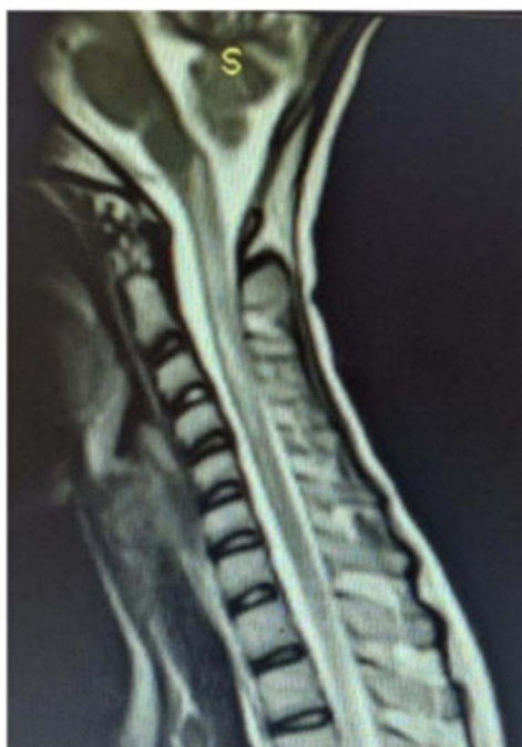
Figure 1 Cervical spinal MRI shows T2 hyperintense lesions of the cervical cord from foramen magnum to C7 level.

During the recovery period, 5 weeks after the initial symptom, she developed dystonic posturing characterized by intermittent muscle contractions of the upper and lower extremities bilaterally with twisting (Figure 3). The attack gradually increased in frequency and recurred every 15 min, with each episode lasts for 30–40 seconds. It was then precipitated through exercise.