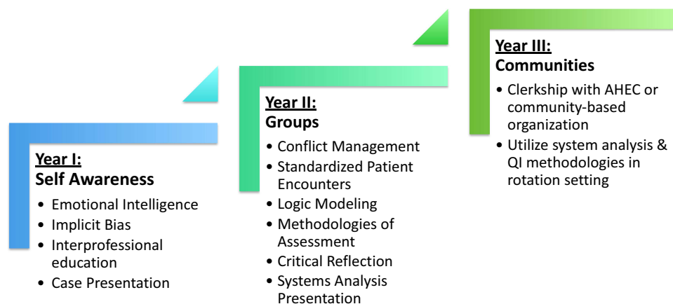
Figure 2 The curricular arc of the Community Service Learning and Leadership curriculum at Rowan-Virtua SOM. Year I focuses on self-awareness and reflection. Year II includes logic models, methodologies, and standardized patient encounters. Year III culminates in a 2-week rotation in a medically underserved community.

CSLL III concludes the longitudinal curriculum, in a 2-week required clerkship located in urban and rural communities with a wide distribution of health inequities in New Jersey. Students are assigned to a community-based organization within one of Rowan-Virtua SOM's clinical hub sites or within a one of three local AHEC Centers (ie, River, Garden, or Shore AHEC) to facilitate placement in various community-based agencies in the counties served by the NJ AHEC program. Students may be placed at any of AHEC's collaborating service-learning site/host organizations